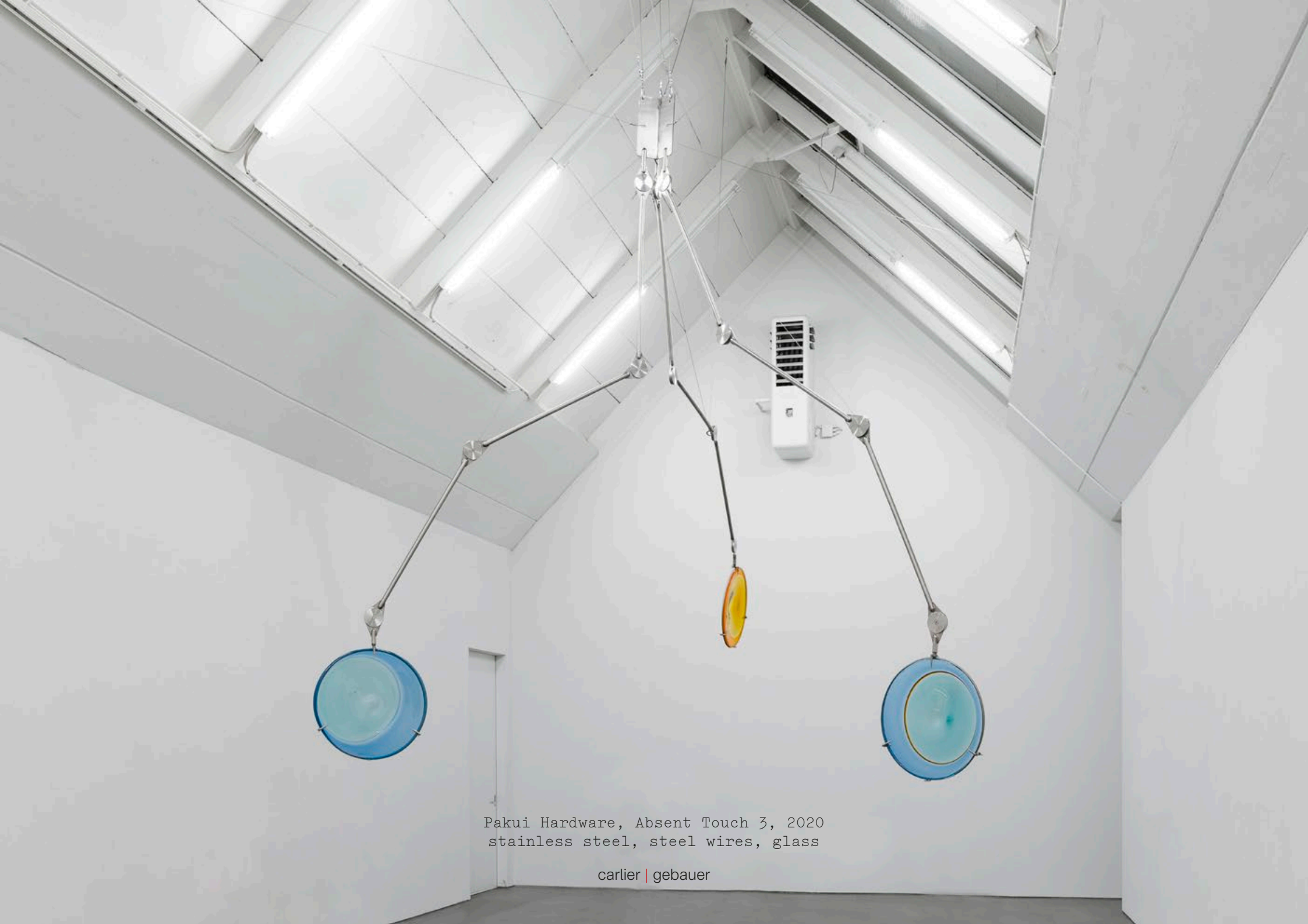
Pakui Hardware, Absent Touch 3, 2020 stainless steel, steel wires, glass