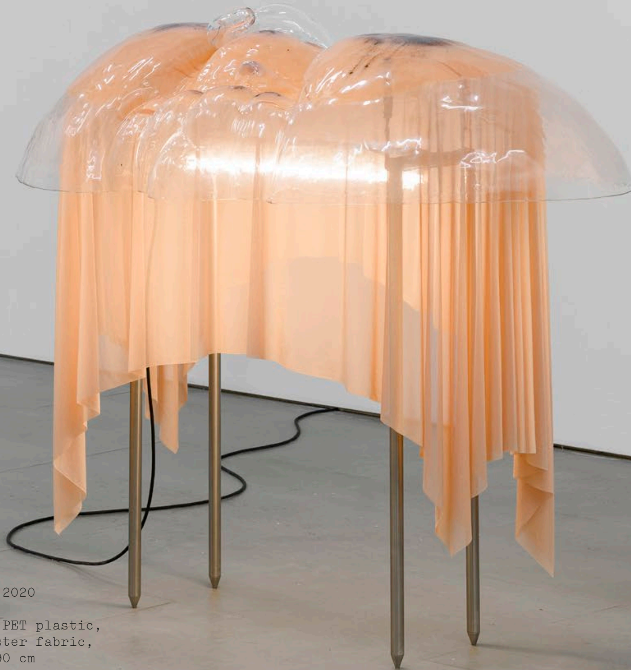
Pakui Hardware, Absent Touch 6, 2020 from the series Absent Touch stainless steel, thermal formed PET plastic, silicon soil, chia seeds, polyester fabric, LED lamps, cables, 120 x 140 x 90 cm