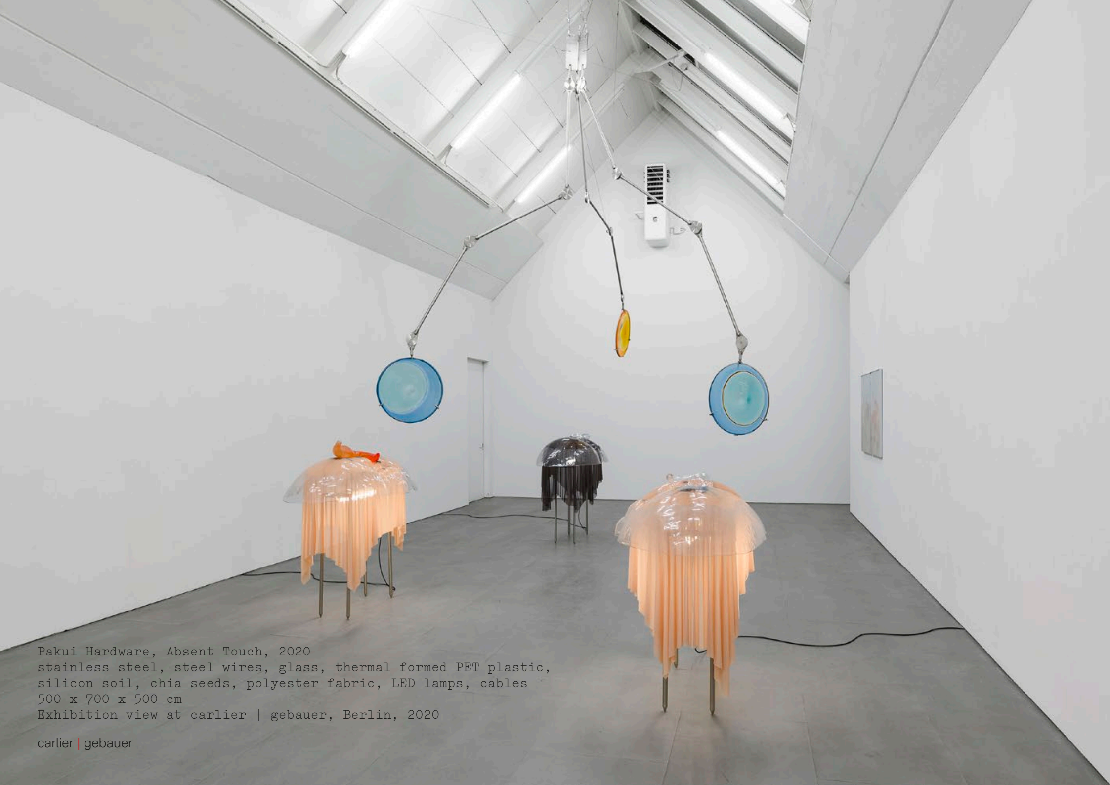
Pakui Hardware, Absent Touch, 2020 stainless steel, steel wires, glass, thermal formed PET plastic, silicon soil, chia seeds, polyester fabric, LED lamps, cables 500 x 700 x 500 cm Exhibition view at carlier | gebauer, Berlin, 2020