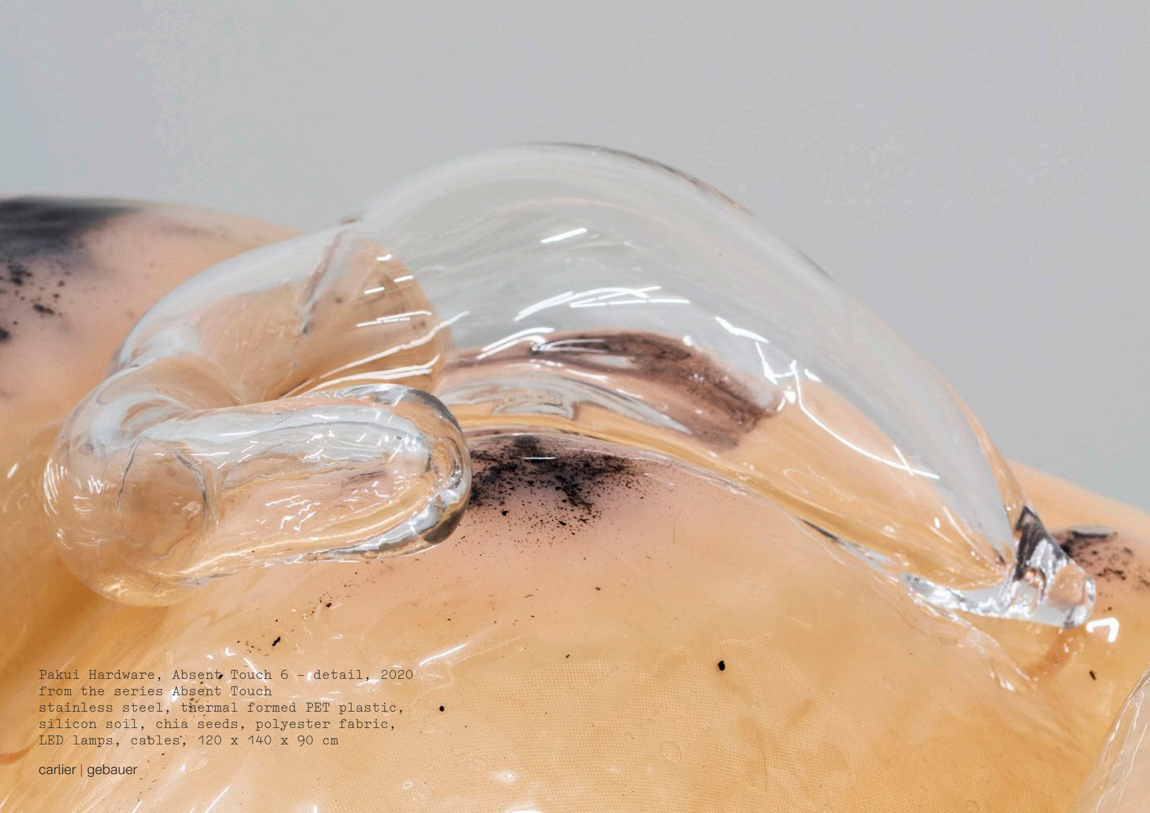
Pakui Hardware, Absent Touch 6 - detail, 2020 from the series Absent Touch stainless steel, thermal formed PET plastic, silicon soil, chia seeds, polyester fabric, LED lamps, cables, 120 x 140 x 90 cm