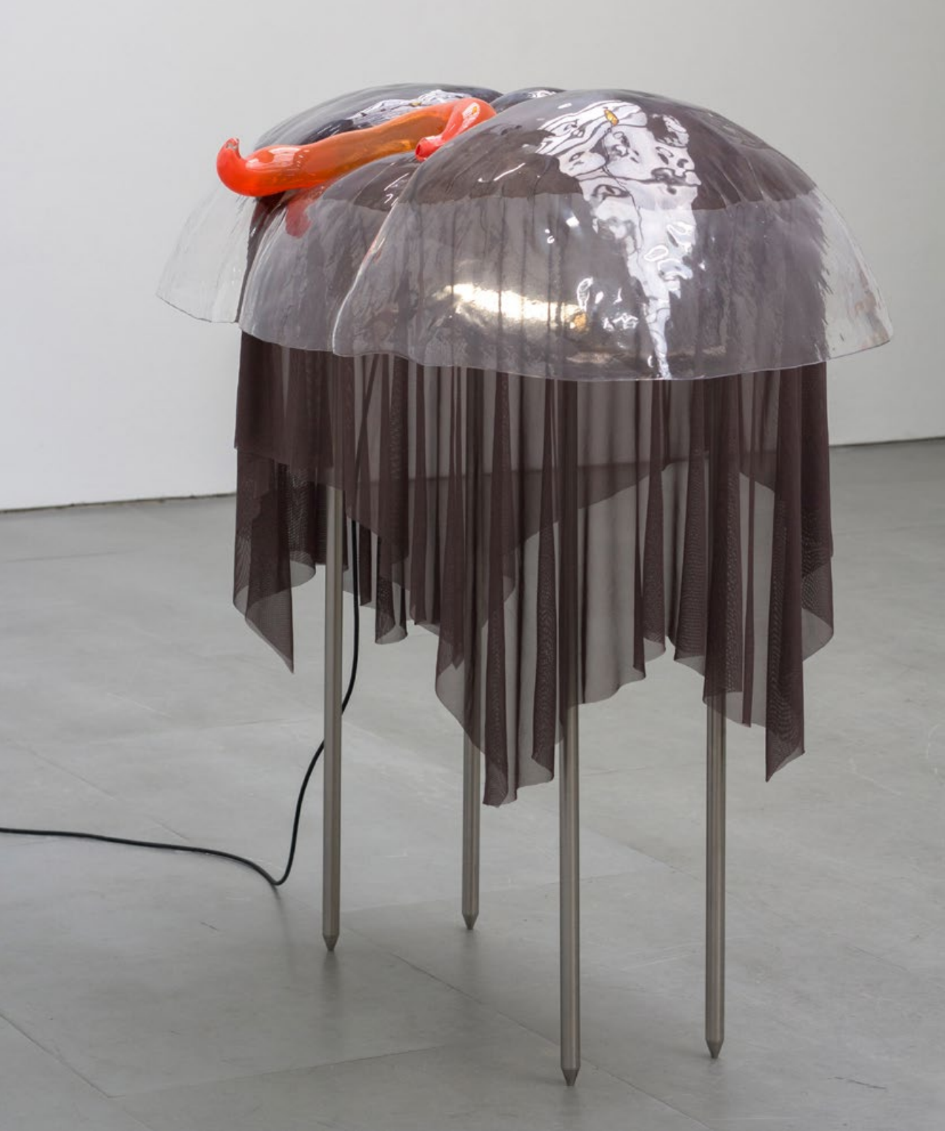
Pakui Hardware, Absent Touch 4, 2020 stainless steel, thermal formed PET plastic, silicon soil, chia seeds, polyester fabric, LED lamps, cables, 120 x 140 x 90 cm