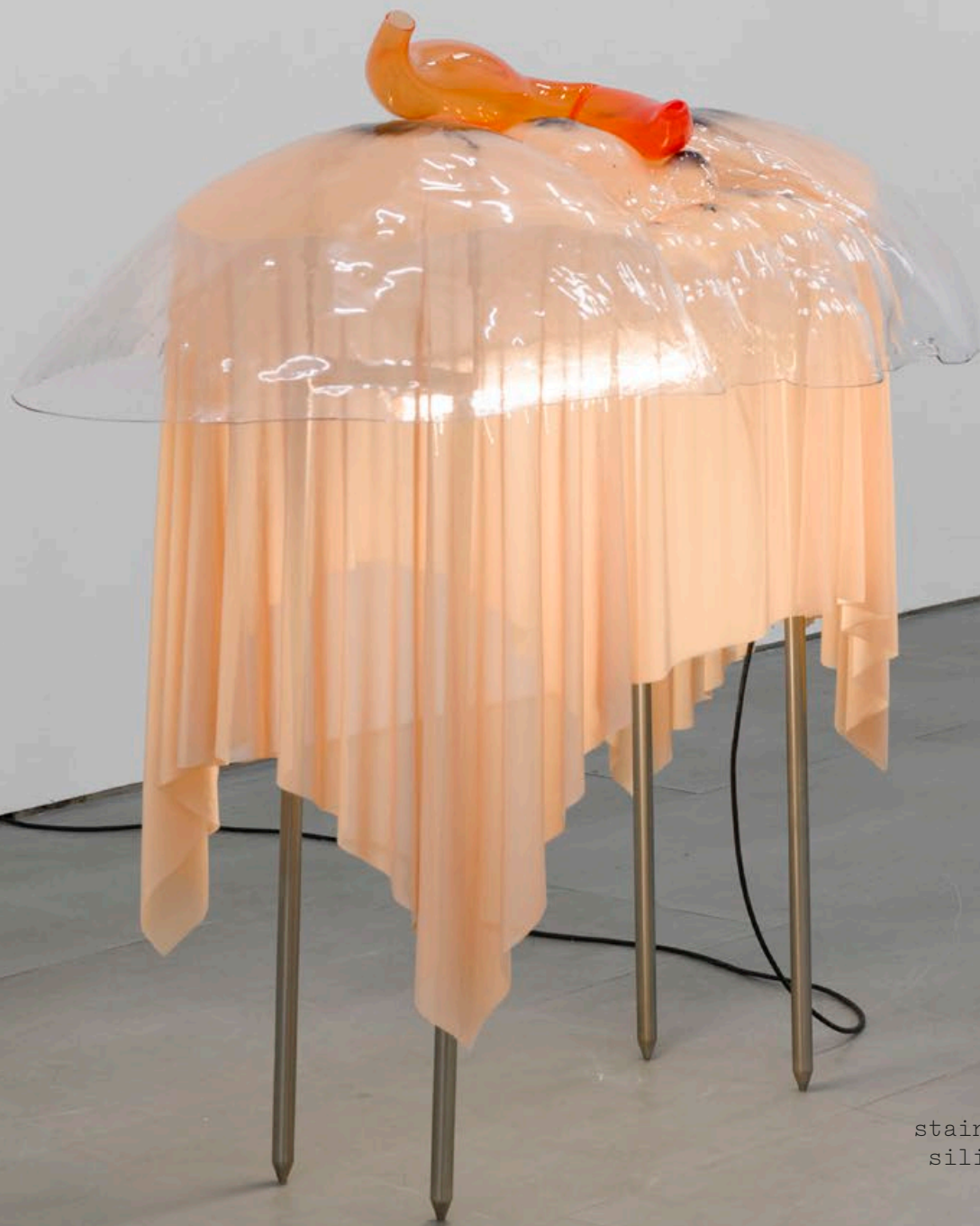
Pakui Hardware, Absent Touch 5, 2020 stainless steel, thermal formed PET plastic, silicon soil, chia seeds, polyester fabric, LED lamps, cables, 120 x 140 x 90 cm