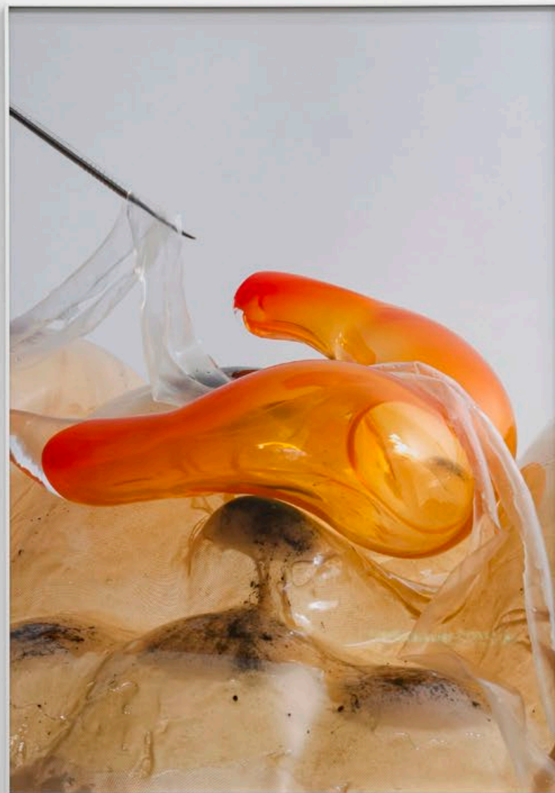
Pakui Hardware, Absent Touch 2, 2020 diptych, giclee print, aluminum frame, museumsglas, 100 x 70 cm each, edition of 3 + 2 AP