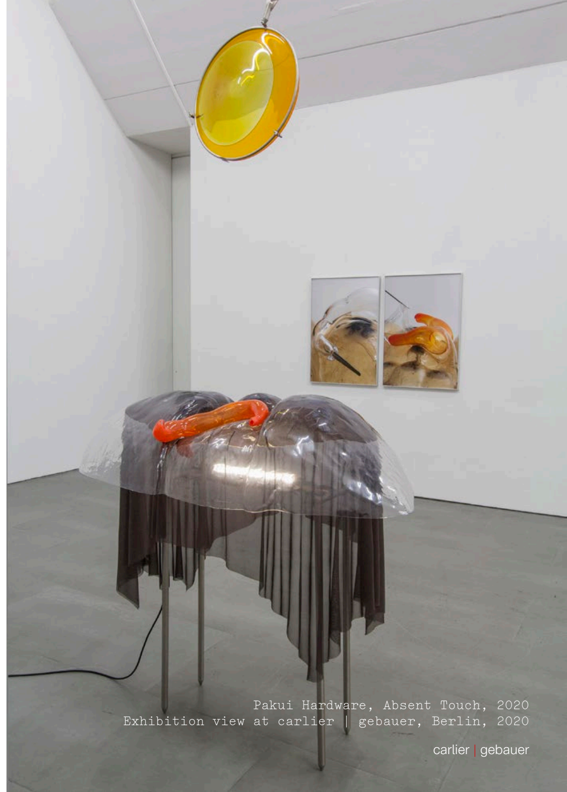
Pakui Hardware, Absent Touch, 2020 Exhibition view at carlier | gebauer, Berlin, 2020