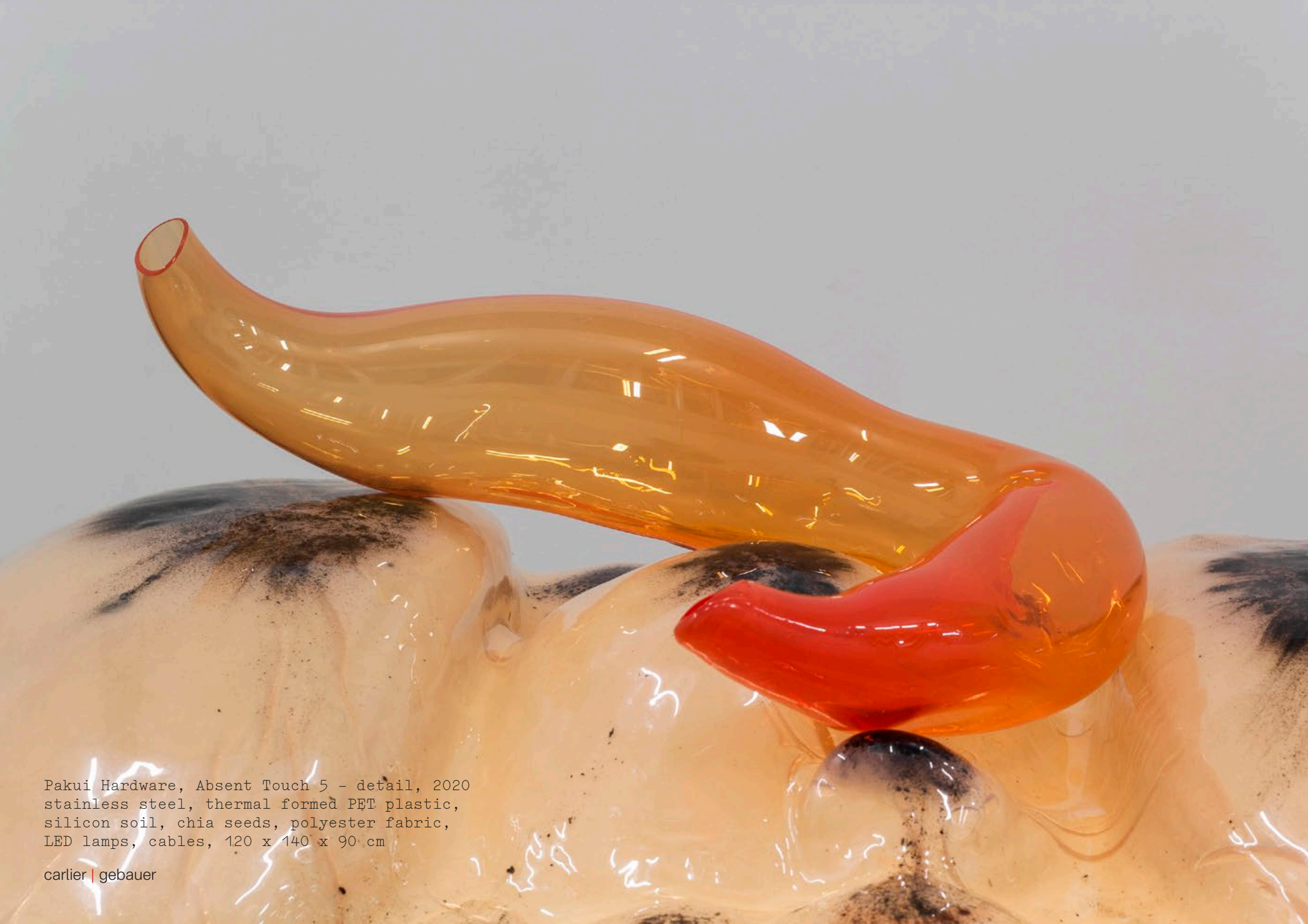
Pakui Hardware, Absent Touch 5 - detail, 2020 stainless steel, thermal formed PET plastic, silicon soil, chia seeds, polyester fabric, LED lamps, cables, 120 x 140 x 90 cm