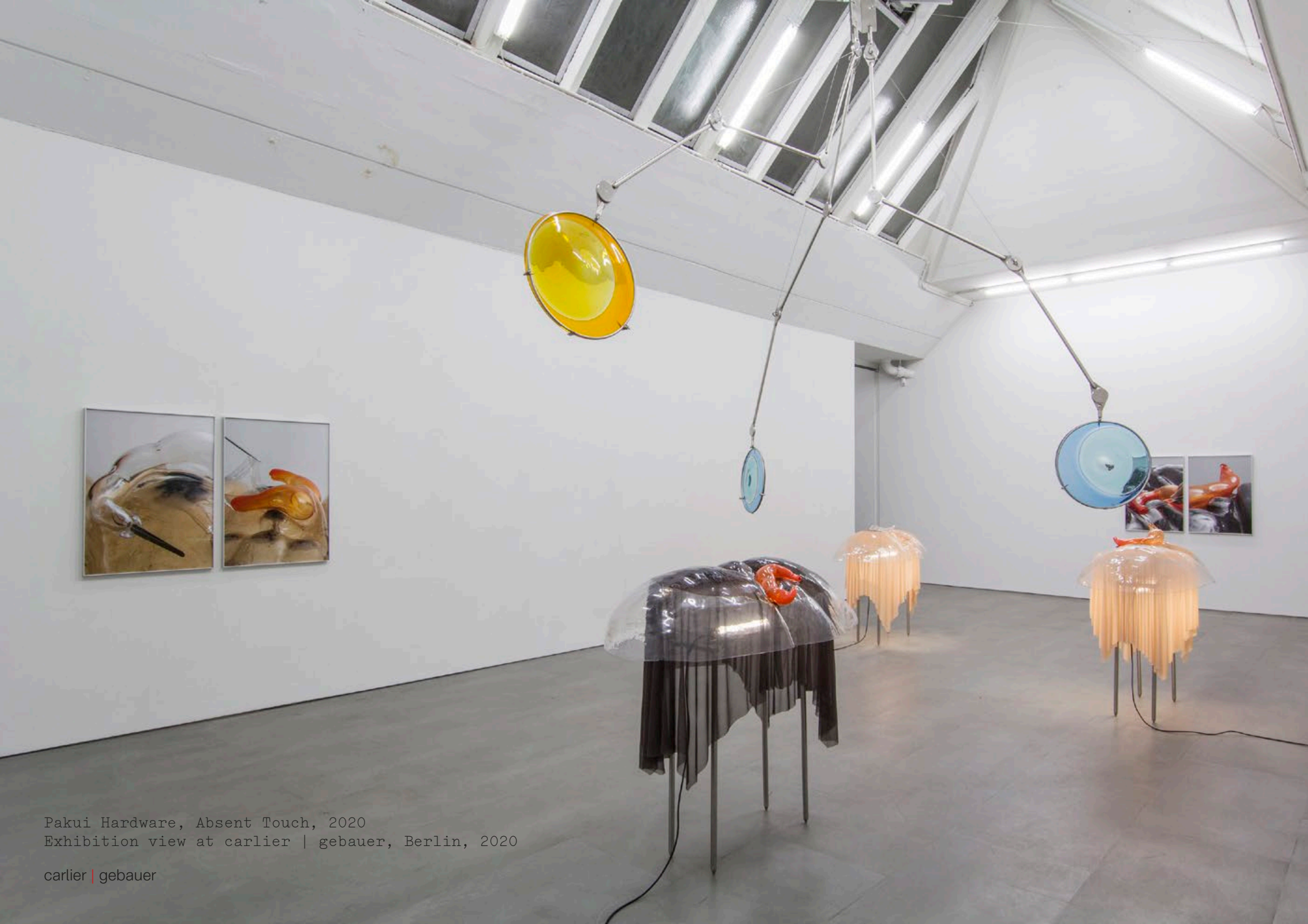
Pakui Hardware, Absent Touch, 2020 Exhibition view at carlier | gebauer, Berlin, 2020