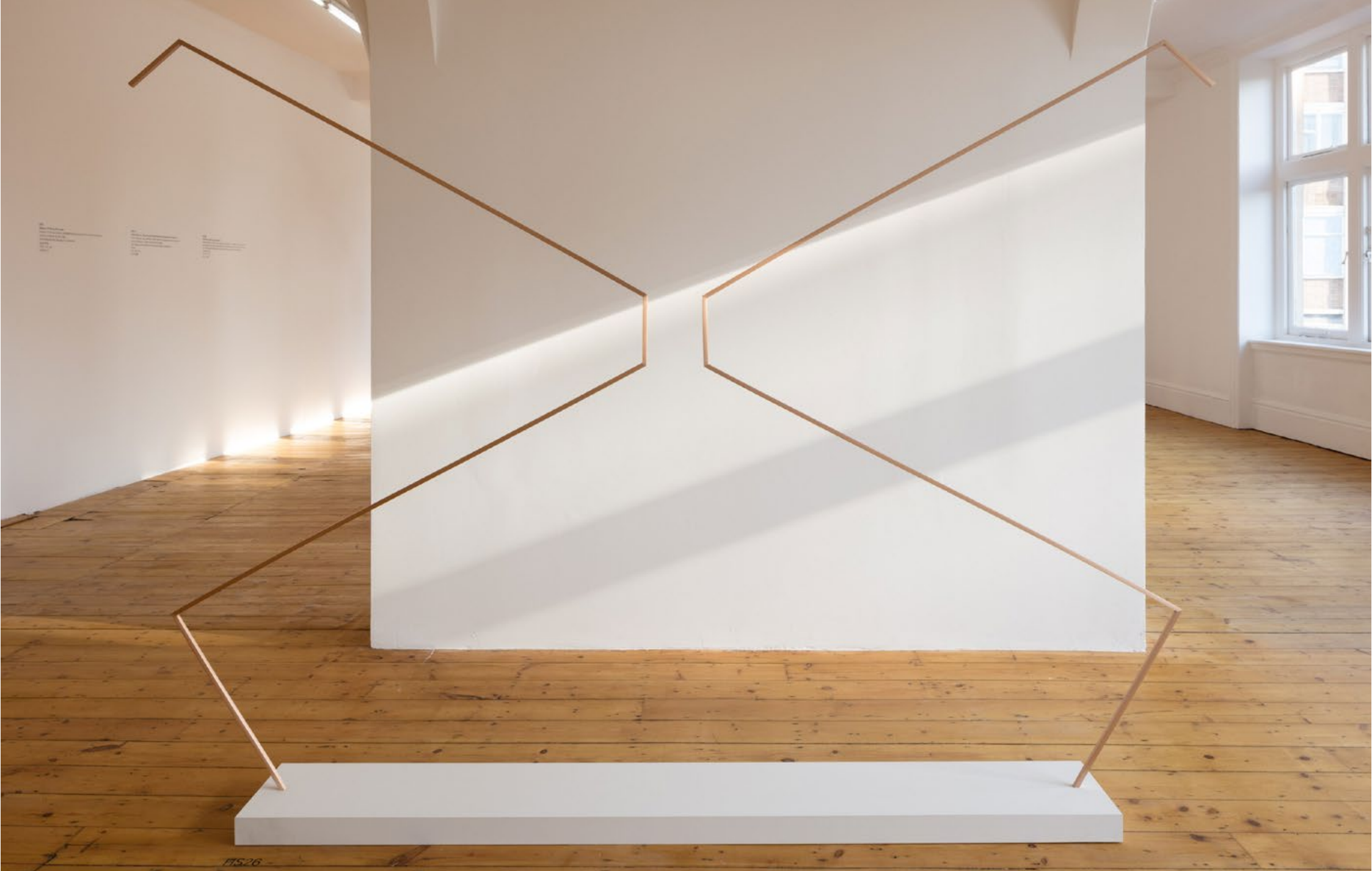
Iman Issa, Heritage Studies #26, 2017, Brass, white wooden plinth, 176 x 20 x 161,5 cm, vinyl text, edition of 3 + 2 AP carlier | gebauer