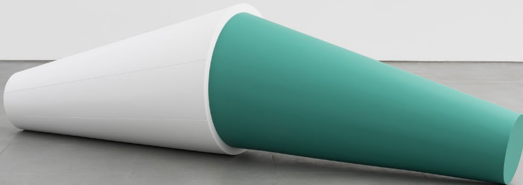
Iman Issa, Heritage Studies #22, 2016 Painted wood, vinyl text, 68 x 68 x 245 cm, edition of 3 + 2 AP sculpture

1902 L'œuvre est une sculpture en bois peinte, réalisée en 2016 par Iman Issa. Elle est composée d'un cône blanc et d'un cône vert, qui sont assemblés pour former une seule forme. La sculpture est présentée sur un socle en bois.